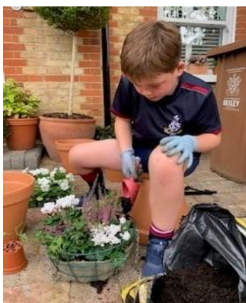
Oscar - a sunflower growing winner, using the garden voucher he won to plant hanging baskets at home.

Sector 4 of our Forest School, an exciting new place of exploration and discoveries for our young nature enthusiasts, was also launched last term.