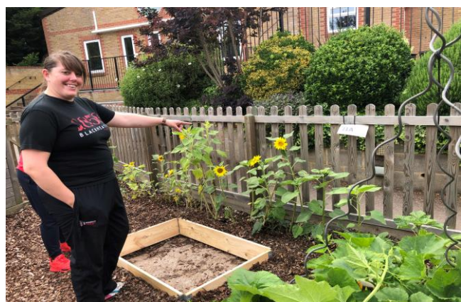
Emily Rutter judges our sunflowers.