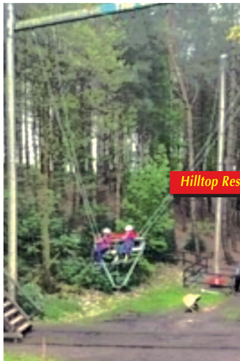
Hilltop Residential Trip

This year, Science is paired up with Technology (ICT and DT) to be able to fully embrace the theme of ‘Connections’. Nearly all innovations in science, technology, engineering and maths are built on connections between people after all. This topic will