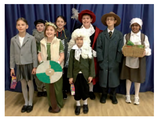
Science & History Dressing Up Day Winners

Our chosen charity for Spring Term was 'Ickle Pickles', a children's charity raising money for intensive care equipment that treats babies born sick or prematurely. We raised £492.86 from the proceeds of our 'Famous Scientist & Historian Dressing Up Day' to end Science Week.