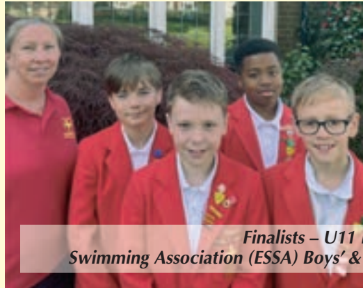
Finalists – U11 Kent English Schools Swimming Association (ESSA) Boys' & Girls' Swimming Team (representing Kent)