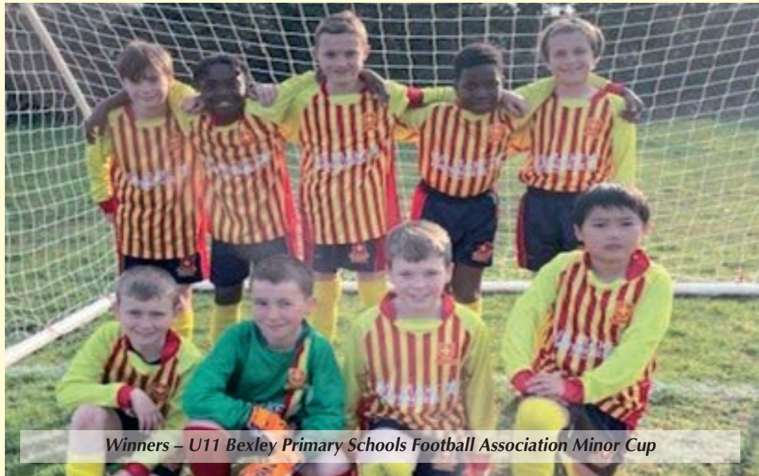
Winners – U11 Bexley Primary Schools Football Association Minor Cup