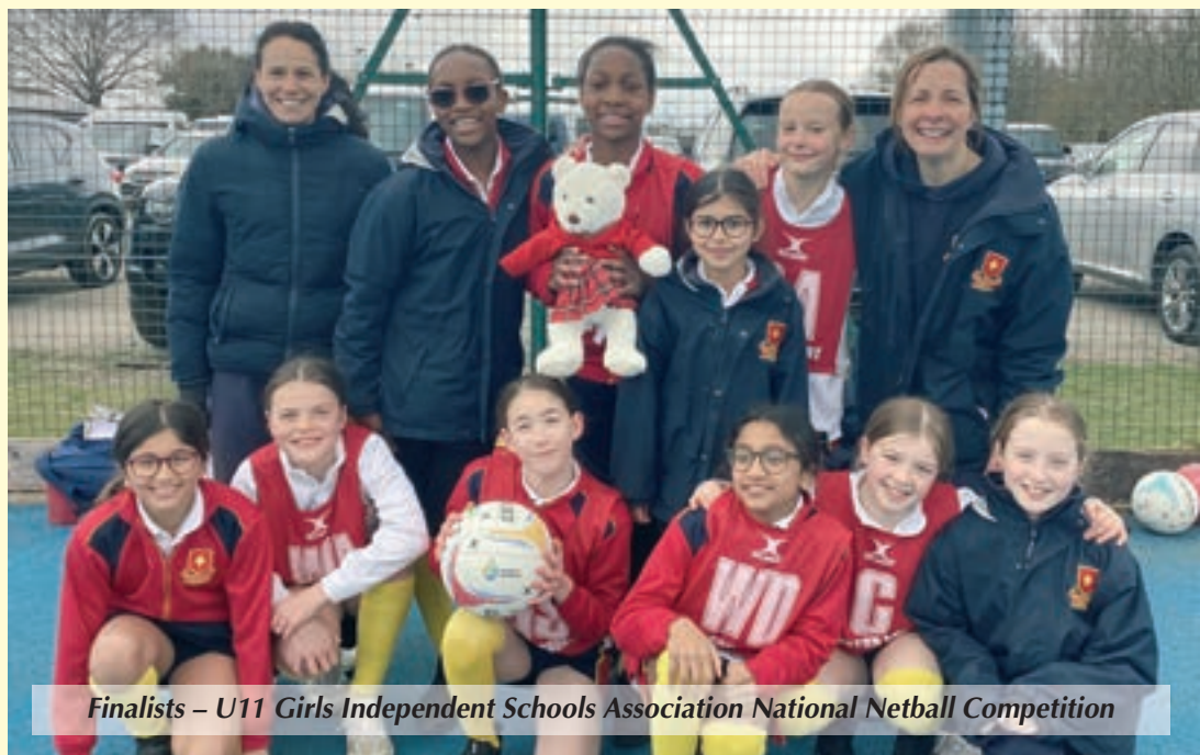
Finalists – U11 Girls Independent Schools Association National Netball Competition